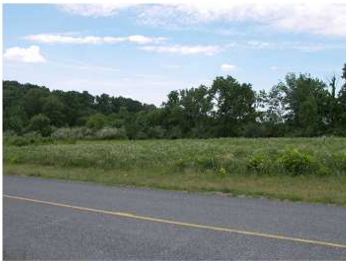
LOT #2 SUGAR RD Fredericksburg, PA

MLS # 124343 Price $79,900 Approx Lot Size 2.1 acres Township Bethel County Lebanon School District Northern Lebanon Elementary School Fredericksburg or Jonestown DIRECTIONS From Fredericksburg, Lickdale Rd. W. to R on Sugar Rd. Lots 2 miles on L. LISTED BY Brownstone Real Estate Co. 1510 Cornwall Rd Lebanon, PA 17042 717.279.6222