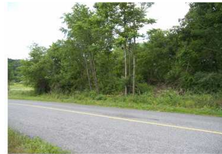
LOT #3 SUGAR RD Fredericksburg, PA

MLS # 124345 Price $79,900 Approx Lot Size 2.1 acres Township Bethel County Lebanon School District Northern Lebanon Elementary School Fredericksburg or Jonestown DIRECTIONS From Fredericksburg, Lickdale Rd. W. to R on Sugar Rd. Lots 2 miles on L. LISTED BY Brownstone Real Estate Co. 1510 Cornwall Rd Lebanon, PA 17042 717.279.6222